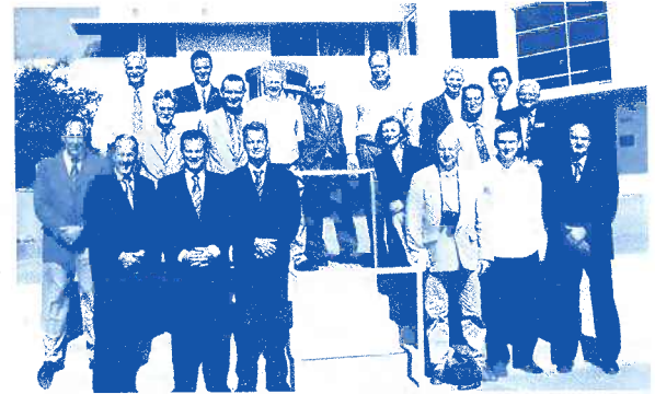
OWD staff and water officials from the Netherlands in front of District Headquarters.

With much of the Netherlands and its population living at or below sea level, the Dutch have nearly one thousand years of experience building and maintaining levees and are widely considered to have the best water management systems in the world.