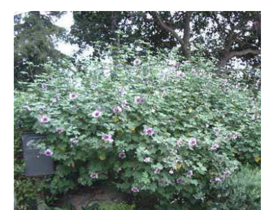
LAVATERA MARITIMA / TREE MALLOW REMARKS: EVERGREEN SCREEN MATURE SIZE: 6'H x 6'W