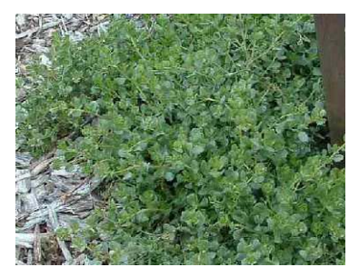
BACCHARIS PILULARIS 'PIGEON POINT' / COYOTE BRUSH REMARKS: ATTRACTS BUTTERFLIES; PRUNE YEARLY PROVIDES FOOD FOR BIRDS & WILDLIFE MATURE SIZE: 2'H x 8'W