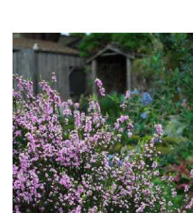
COLEONEMA PULCHRUM / PINK BREATH OF HEAVEN REMARKS: ATTRACTS BUTTERFLIES MATURE SIZE: 6'H x 5'W