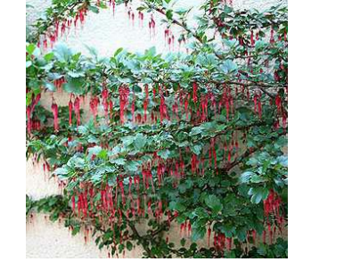
RIBES SPECIOSUM / FUCHSIA FLOWERING GOOSEBERRY REMARKS: ATTRACTS BIRDS, HUMMINGBIRDS; DECIDUOUS MATURE SIZE: 6'H x 4'W