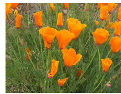
ESCHSCHOLZIA CALIFORNICA / CALIFORNIA POPPY REMARKS: ANNUAL COLOR; ATTRACTS BIRDS AND BUTTERFLIES MATURE SIZE: 1'H x 1'W