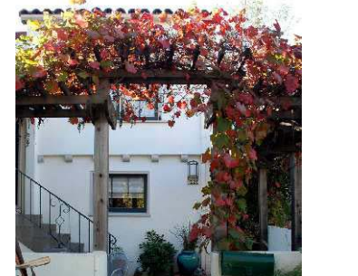
VITIS CALIFORNICA 'ROGER'S RED' / CALIFORNIA WILD GRAPE REMARKS: ATTRACTS BIRDS AND BUTTERFLIES; DECIDUOUS MATURE SIZE: TO 30'