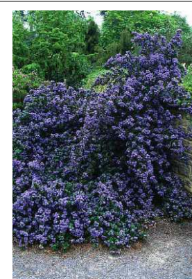
CEANOTHUS X 'CONCHA' / CALIFORNIA LILAC REMARKS: ATTRACTS BIRDS, BUTTERFLIES; FRAGRANT; EVERGREEN BACKGROUND; INFREQUENT WATERING MATURE SIZE: 7'H x 7'W