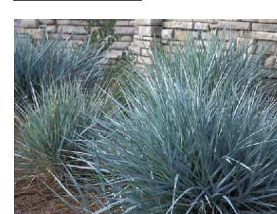
LEYMUS CONDENSATUS 'CANYON PRINCE' / NATIVE BLUE RYE REMARKS: EVERGREEN ACCENT; ORNAMENTAL GRASS MATURE SIZE: 3'H x 3'W