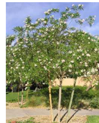
CHITALPA TASHKENTENSIS 'PINK DAWN' / PINK DAWN CHITALPA BUSH REMARKS: DECIDUOUS; ATTRACTS HUMMINGBIRDS AND BUTTERFLIES MATURE SIZE: 30'H x 30'W