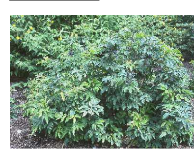
MAHONIA AQUIFOLIUM 'COMPACTA' / COMPACT OREGON GRAPE REMARKS: ATTRACTS BIRDS MATURE SIZE: 3'H x 3'W