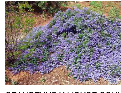
CEANOTHUS X 'JOYCE COULTER' / CEANOTHUS JOYCE COULTER REMARKS: ATTRACTS BIRDS, BUTTERFLIES; FRAGRANT INFREQUENT WATERING MATURE SIZE: 3'H x 6'W