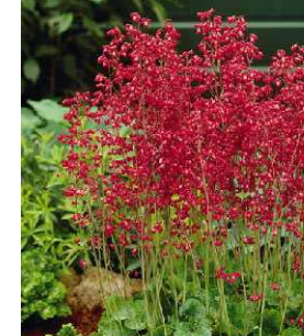
HEUCHERA SANGUINEA 'FIREFLY' / CORAL BELLS REMARKS: PERENNIAL BORDER; SPRING/SUMMER BLOOM; ATTRACTS BUTTERFLIES AND HUMMINGBIRDS MATURE SIZE: 1.5'H x 1.5'W