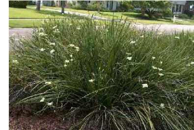
DIETES BICOLOR / FORTNIGHT LILY REMARKS: ATTRACTS BIRDS, BUTTERFLIES MATURE SIZE: 3'H x 3'W