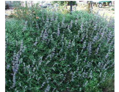
SALVIA X 'GRACIAS' / CREEPING SAGE REMARKS: ATTRACTS BIRDS, BUTTERFLIES; MAY MATURE SIZE: 2'H x 5'W