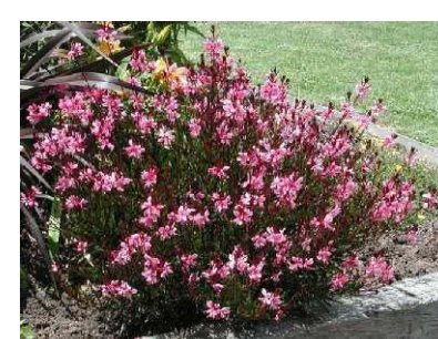
GAURA LINDHEIMERI 'SISKIYOU PINK' / SISKIYOU PINK GAURA REMARKS: PERENNIAL ACCENT MATURE SIZE: 3'H x 3'W