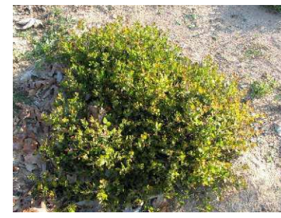
ARCTOSTAPHYLOS X 'SUNSET' / SUNSET MANZANITA REMARKS: EVERGREEN BACKGROUND; ATTRACTS BIRDS, BUTTERFLIES MATURE SIZE: 2'H x 2'W