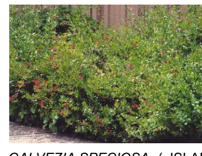
GALVEZIA SPECIOSA / ISLAND BUSH SNAPDRAGON REMARKS: ATTRACTS HUMMINGBIRDS; SUMMER/FALL BLOOMING MATURE SIZE: 5'H x 5'W