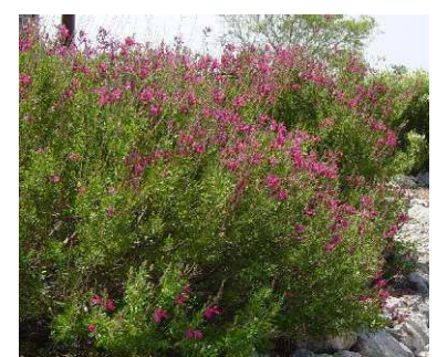
SALVIA GREGGII / AUTUMN SAGE REMARKS: ATTRACTS HUMMINGBIRDS MATURE SIZE: 3'H x 3'W