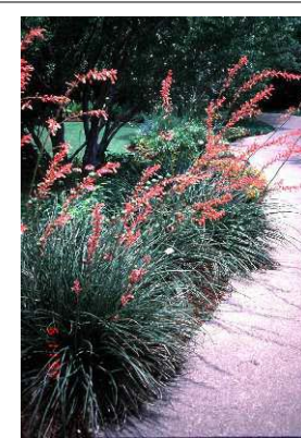
HESPERALOE PARVIFLORA / RED YUCCA REMARKS: EVERGREEN ACCENT MATURE SIZE: 3'H x 4'W