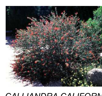
CALLIANDRA CALIFORNICA / RED BAJA FAIRY DUSTER REMARKS: SPECIMEN/SCREEN; YEAR-ROUND COLOR; ATTRACTS BUTTERFLIES, HUMMINGBIRDS; LIMIT PRUNING MATURE SIZE: 6'H x 6'W