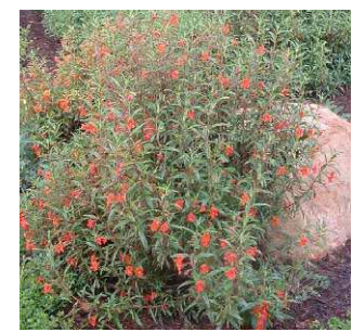
DIPLOACUS PUNICEUS / RED MONKEYFLOWER REMARKS: APRIL-JULY; ATTRACTS HUMMINGBIRDS, BUTTERFLIES MATURE SIZE: 2'H x 2'W