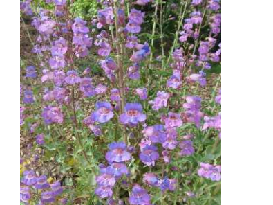
PENSTEMON SPECTABILIS / SHOWY PENSTEMON REMARKS: ATTRACTS BIRDS, HUMMINGBIRDS, BUTTERFLIES; APRIL-JUNE SHOWY COLOR; REMOVE SPENT FLOWERS MATURE SIZE: 3'H x 3'W