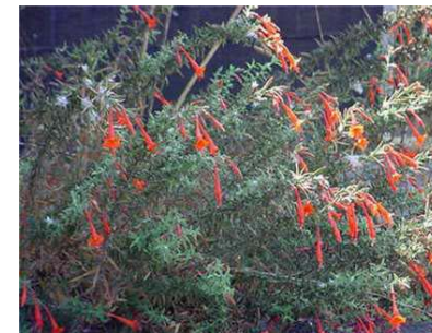
ZAUSCHNERIA CALIFORNICA / CALIFORNIA FUCHSIA REMARKS: ATTRACTS BUTTERFLIES; LATE SUMMER/FALL MATURE SIZE: 1'H x 3'W