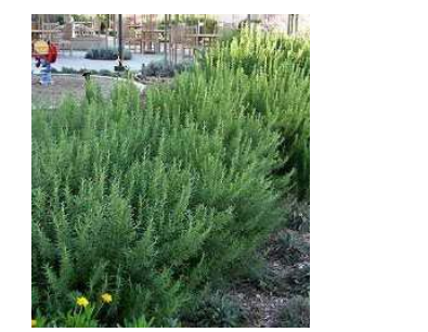
ROSMARINUS OFFICINALIS 'TUSCAN BLUE' / TUSCAN BLUE ROSEMARY REMARKS: ATTRACTS BIRDS, BUTTERFLIES; FRAGRANT MATURE SIZE: 6'H x 4'W