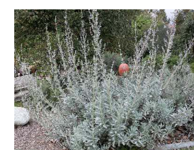
SALVIA APIANA / WHITE SAGE REMARKS: ATTRACTS BIRDS, BUTTERFLIES; FRAGRANT; NEEDS GOOD DRAINAGE, VERY LOW WATER MATURE SIZE: 4'H x 4'W