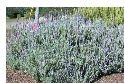
LAVANDULA DENTATA / FRENCH LAVENDER REMARKS: ATTRACTS HUMMINGBIRDS; FRAGRANT; PRUNE MID-SUMMER, LATE FALL MATURE SIZE: 3'H x 3'W