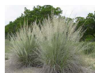
MUHLENBERGIA LINDHEIMERI / LINDHEIMER'S MUHLY REMARKS: EVERGREEN ACCENT; ORNAMENTAL GRASS MATURE SIZE: 5'H x 4'W