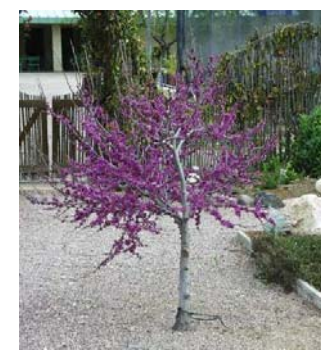
CERCIS OCCIDENTALIS / WESTERN REDBUD REMARKS: PROVIDES FOOD FOR BIRDS & WILDLIFE MATURE SIZE: 15'H x 15'W