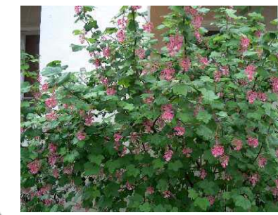
RIBES SANGUINEUM GLUTINOSUM / RED FLOWERING CURRANT REMARKS: ATTRACTS BIRDS, HUMMINGBIRDS; DECIDUOUS MATURE SIZE: 6'H x 6'W