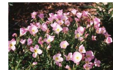
OENOTHERA SPECIOSA / MEXICAN EVENING PRIMROSE REMARKS: ATTRACTS HUMMINGBIRDS; ANNUAL COLOR MATURE SIZE: 1'H x 1.5'W