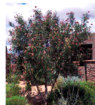
CHILOPSIS LINEARIS / DESERT WILLOW REMARKS: PROVIDES FOOD FOR BIRDS & WILDLIFE MATURE SIZE: 30'H x 30'W