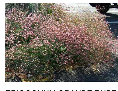
ERIOGONUM GRANDE RUBESCENS / RED BUCKWHEAT REMARKS: ATTRACTS BUTTERFLIES MATURE SIZE: 2'H x 2'W