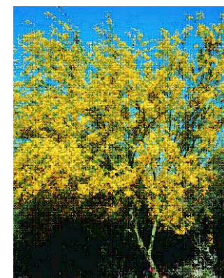
PARKINSONIA HYBRID 'DESERT MUSEUM' / DESERT MUSEUM PALO VERDE REMARKS: DECIDUOUS; GREEN THORNLESS TRUNK; SHOWY YELLOW BLOOM IN SPRING/SUMMER MATURE SIZE: 25'H x 25'W