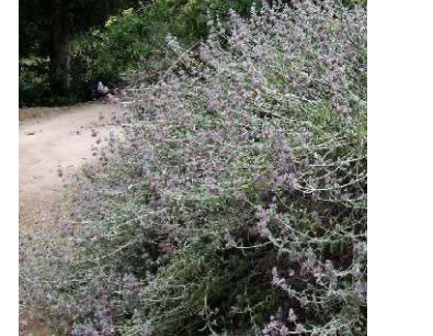
SALVIA LEUCOPHYLLA / PURPLE LEAF SAGE REMARKS: ATTRACTS BIRDS, BUTTERFLIES; MAY-JULY; PRUNE STEMS EVERY 1-2 YEARS; FRAGRANT MATURE SIZE: 3'H x 3'W