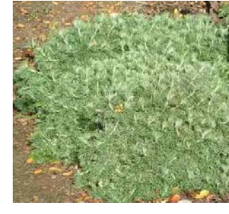
ARTEMISIA CALIFORNICA 'MONTARA' / PROSTRATE CALIFORNIA SAGEBRUSH REMARKS: EVERGREEN, FRAGRANT; PRUNE YEARLY; ATTRACTS BIRDS, BUTTERFLIES MATURE SIZE: 1.5'H x 4'W