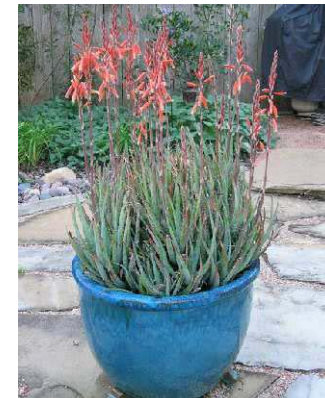
ALOE X 'BLUE ELF' / ALOE REMARKS: POTTED ACCENT; SUCCULENT; YEAR-ROUND INTEREST MATURE SIZE: 2'H x 2'W