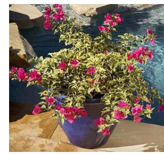
BOUGAINVILLEA X 'RASPBERRY ICE' / BOUGAINVILLEA REMARKS: YEAR-ROUND COLORFUL ACCENT; ATTRACTS BUTTERFLIES MATURE SIZE: 3'H x 6'W