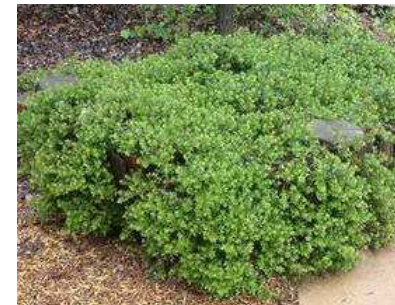
ARCTOSTAPHYLOS X 'EMERALD CARPET' / EMERALD CARPET MANZANITA REMARKS: ATTRACTS BIRDS, BUTTERFLIES; PROVIDES FOOD/SHELTER FOR BIRDS AND WILDLIFE MATURE SIZE: 1'H x 6'W