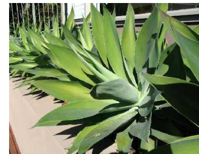
AGAVE ATTENUATA / AGAVE REMARKS: ACCENT; SUCCULENT; YEAR-ROUND INTEREST MATURE SIZE: 5'H x 5'W