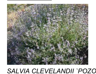
SALVIA CLEVELANDII 'POZO BLUE' / CLEVELAND SAGE REMARKS: ATTRACTS BIRDS, BUTTERFLIES; FRAGRANT MATURE SIZE: 5'H x 5'W