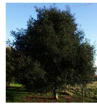
QUERCUS AGRIFOLIA / COAST LIVE OAK REMARKS: EVERGREEN; BIRDS AND BUTTERFLIES; PROVIDES WILDLIFE SHELTER MATURE SIZE: 65'H x 30'W