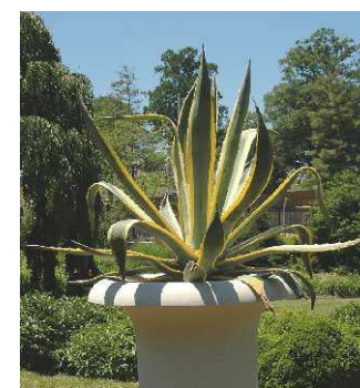
AGAVE AMERICANA 'VARIEGATA' / VARIEGATED CENTURY PLANT REMARKS: POTTED ACCENT; SUCCULENT; YEAR-ROUND INTEREST MATURE SIZE: 6'H x 10'W