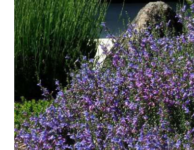
PENSTEMON HETEROPHYLLUS 'MARGARITA BOP' / MARGARITA BOP PENSTEMON REMARKS: SHOWY JUNE PERENNIAL; ATTRACTS HUMMINGBIRDS AND BUTTERFLIES MATURE SIZE: 3'H x 2'W