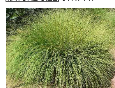
MUHLENBERGIA RIGENS / DEER GRASS REMARKS: EVERGREEN ACCENT; ORNAMENTAL GRASS MATURE SIZE: 5'H x 4'W